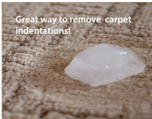
Great way to remove carpet indentations!