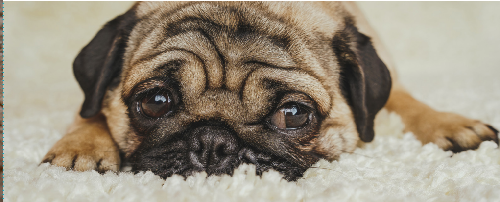
Blacklight image showing hidden pet spots.

not to touch the iron directly to the carpet's fibers.